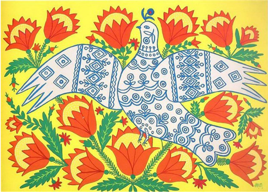
A Dove Has Spread Her Wings and Asks for Peace (1982) by Maria Prymachenko